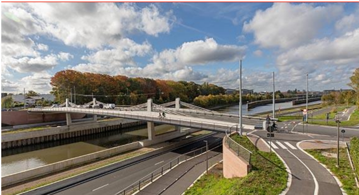
Externally prestressed concrete road bridge with cantilevered light fibre reinforced composite bicycle deck. With SBE and Franki Construct.