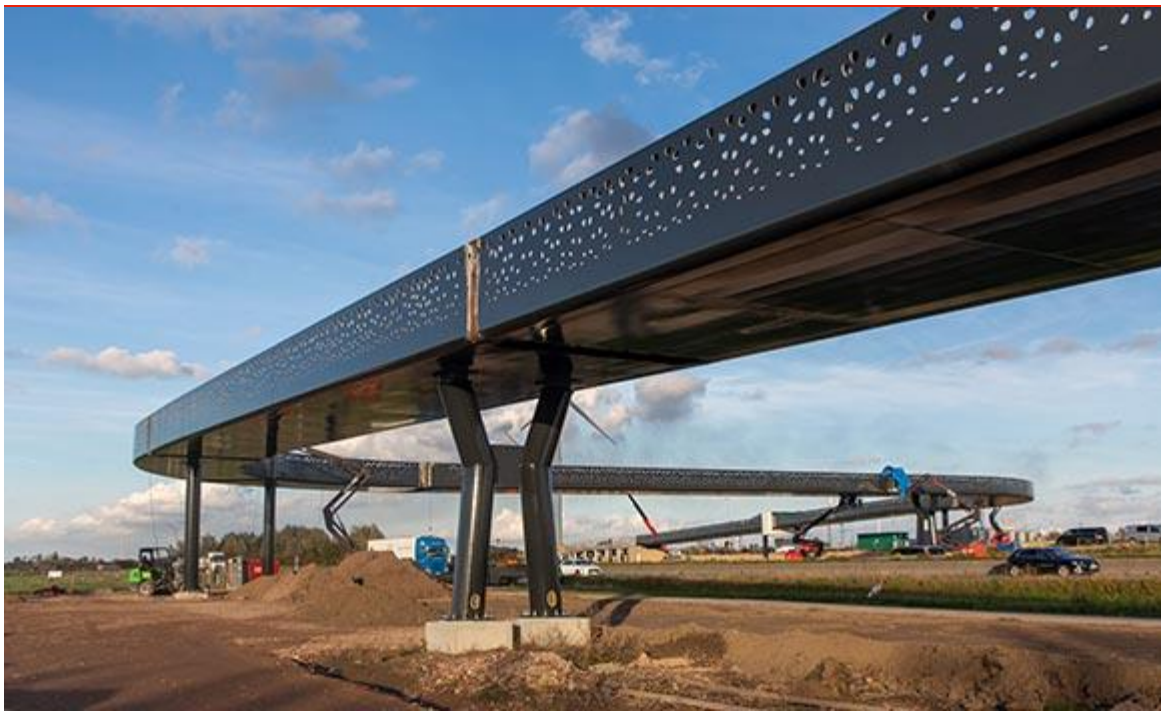
Three large bicycle bridges across the R4 ring road north of Ghent. Slender steel structures with load-bearing U-shaped cross-section.